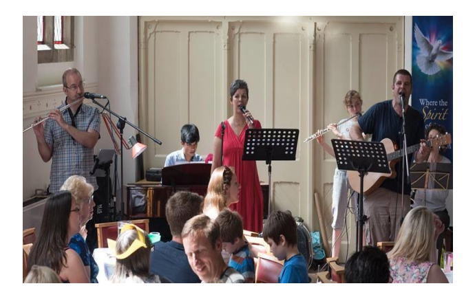
Some of our musicians leading worship