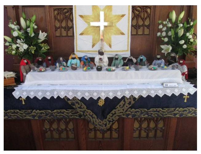
One of the many delightful scenes from the Knitted Bible

Ramsey Millions have also used the church as a venue for their meetings and we are looking forward to the WI drama group's Pantomime in December. The Church hosted "The Knitted Bible" in October 2017 with over 40 scenes from the scriptures on view to local schools as well as the general public, before it went to different churches in the circuit.