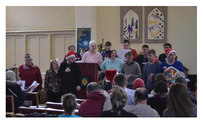
The Moving On Group Carol Service

Huntingdon District Council has development plans for the next twenty years to build around 8,900 new homes in the town and its catchment area – including the major development at Alconbury Weald - which will be a mix of social and private housing. The Council also has plans to develop and substantially increase the business community, partly enabled by the improvements currently being made to the A14 dual carriageway. This will bring more people and visitors into the town daily.