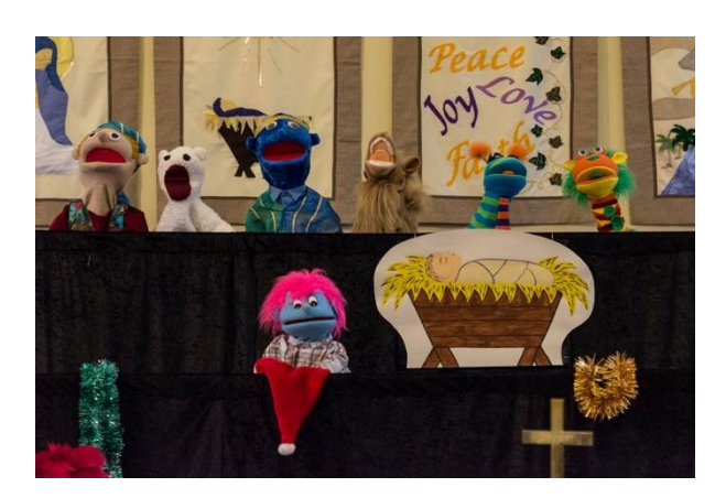
Our puppets explain the nativity story