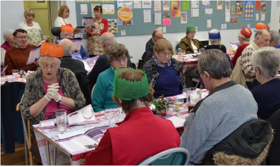
Our Seniors Christmas Lunch