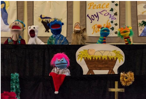
Our puppets explain the nativity story