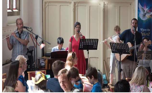
Some of our musicians leading worship