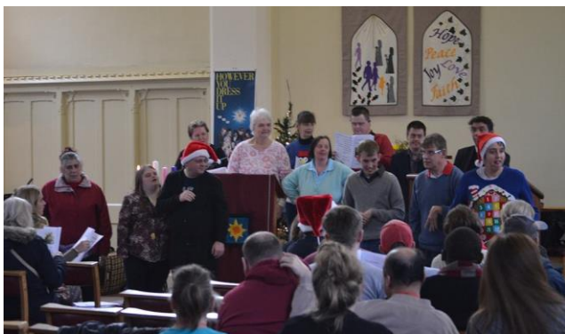
The Moving On Group Carol Service

Huntingdon District Council has development plans for the next twenty years to build around 8,900 new homes in the town and its catchment area – including the major development at Alconbury Weald - which will be a mix of social and private housing. The Council also has plans to develop and substantially increase the business community, partly enabled by the improvements currently being made to the A14 dual carriageway. This will bring more people and visitors into the town daily.