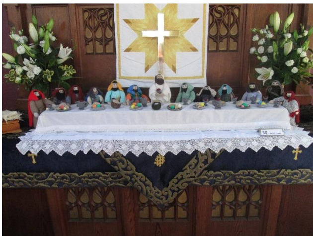
One of the many delightful scenes from the Knitted Bible

Ramsey Millions have also used the church as a venue for their meetings and we are looking forward to the WI drama group’s Pantomime in December.