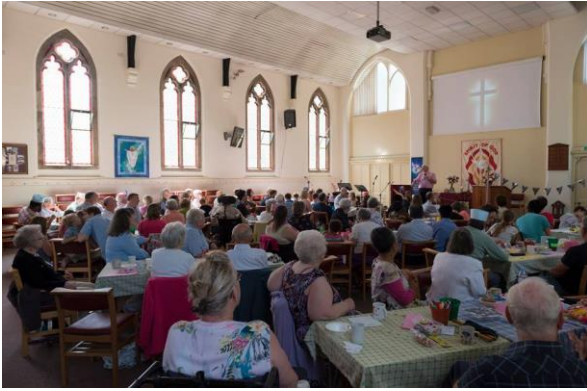
JF's 211th Anniversary All Age Worship