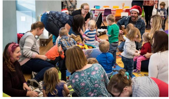
Seedlings "pre-schoolers" Christmas Party

Our primary challenge for the next 12 to 18 months is to complete Phase 3 of our Here4Huntingdon (H4H) project.